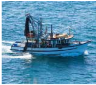
Fishing & Aquaculture