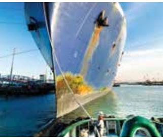
Marine & Shipping